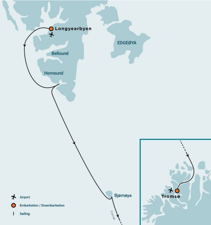
Chart the icy waters of Spitsbergen, exploring spectacular fjords and glaciers in Hornsund, a world of imposing sea cliffs and Arctic history. With seas rich in seals and whales, there are chances for spotting polar bears throughout. Before reaching Tromsø, a visit to remote Bear Island awaits.