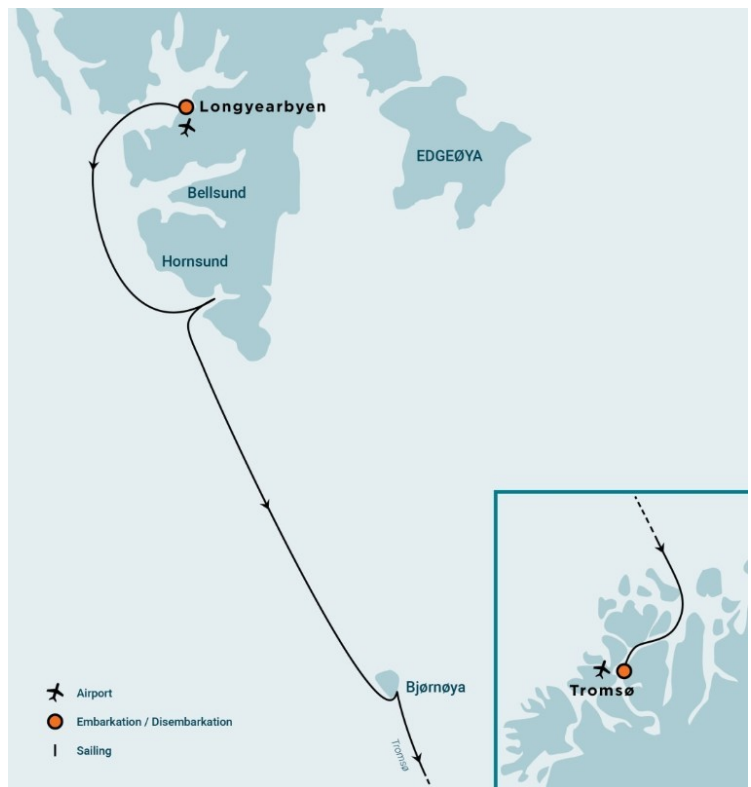
Chart the icy waters of Spitsbergen, exploring spectacular fjords and glaciers in Hornsund, a world of imposing sea cliffs and Arctic history. With seas rich in seals and whales, there are chances for spotting polar bears throughout. Before reaching Tromsø, a visit to remote Bear Island awaits.