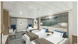
Balcony Stateroom B for single occupancy