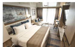
Balcony Stateroom - A