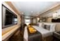
Deluxe Veranda Forward