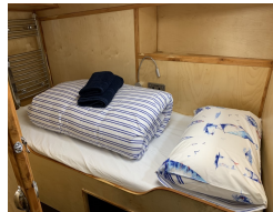
Twin / Double Cabin En-suite