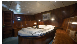
Double Cabin with Sole Occupancy