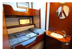
Category A Triple