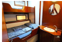
Category A Sole occupancy