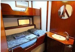
Category A Single