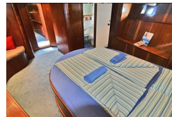
Single Occupancy Double Bed