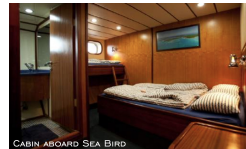
Single Occupancy Double Bed