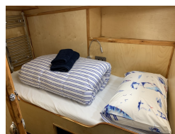
Twin / Double Cabin En-suite