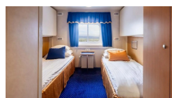
Cabin Category 4