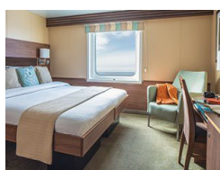
Category 5. From