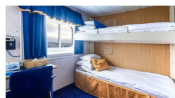
Cabin Category 3