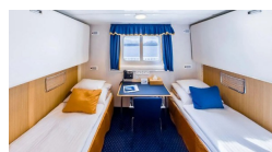
Cabin Category 5