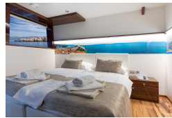
Below Deck Cabin