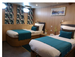
Lower Deck Cabin Single