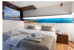
Below Deck Cabin