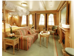
Category B. From