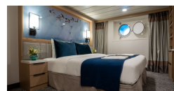
Category E Stateroom