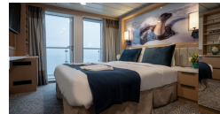
Category C Sup Stateroom