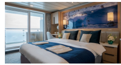
Category B Suite