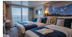
Category C XL Stateroom