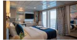
Category C Stateroom