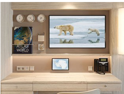
Category 5. From