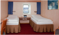
Cat 4 - Twin