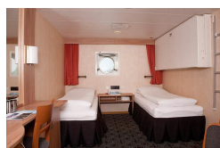
Cat 3 - Twin