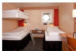
Cat 1A - Quad