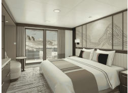
Grand Veranda Suite