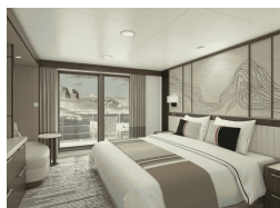
Grand Veranda Suite