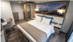
Balcony Stateroom - C Balcony Stateroom Superior Captain's Suite Junior Suite