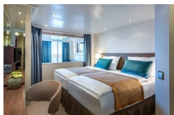
Penthouse Deluxe Suite