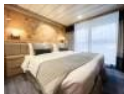
Studio Single Veranda Stateroom