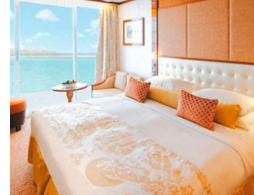
Balcony Stateroom C