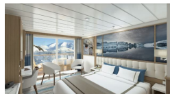
Balcony Stateroom Superior