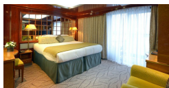
Magellan Deck Standard Single