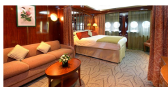
Magellan Deck Standard Suite