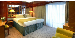
Magellan Deck Standard Single