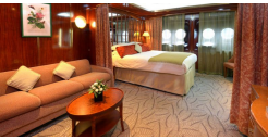
Magellan Deck Standard Suite