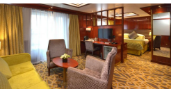
Explorer Deck Owner's Balcony Suite