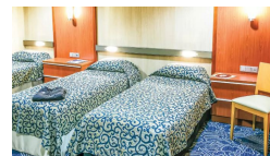
Cabin Category 10