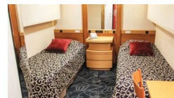
Cabin Category 4