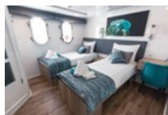
Main/upper deck cabin