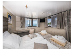
Below Deck Cabin