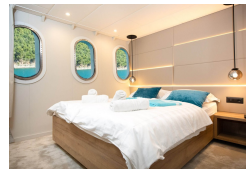
Main Deck VIP Cabin