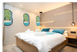
Upper Deck VIP Cabin