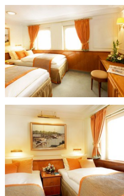
Category 5. From