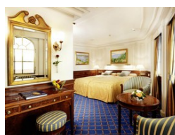
Category D. From