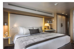
Prestige Deck 5