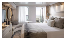
Deluxe Suite Deck 3