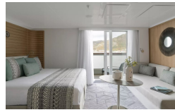
Deluxe Suite Deck 5