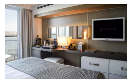
Prestige Deck 5