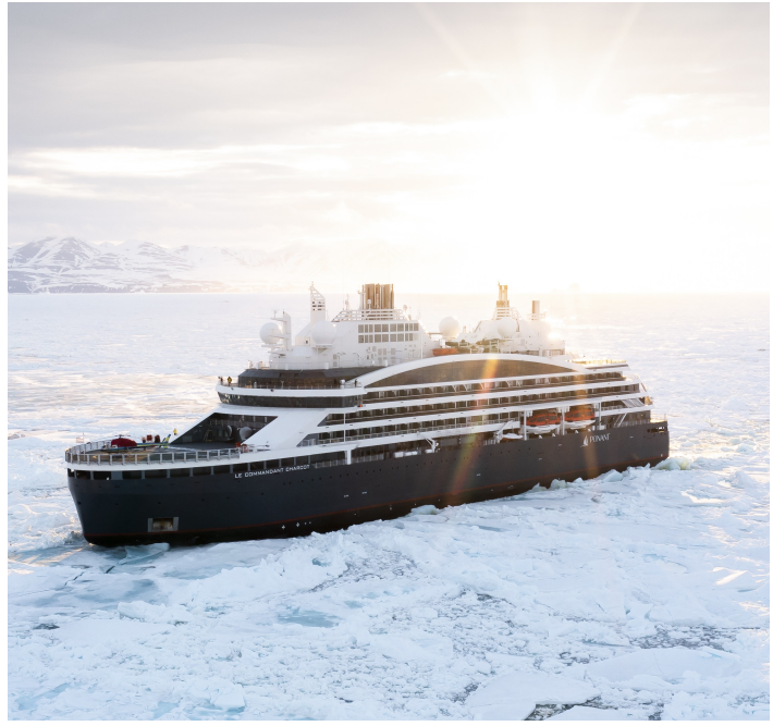
Zodiacs on board.