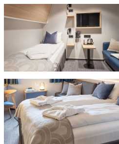
Seaview Superior. From