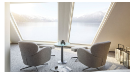
Seaview Superior King