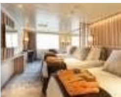
Deluxe Veranda Forward