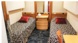
Cabin Category 4