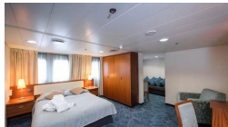
Cabin Category 2