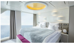
Junior Suite. From