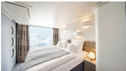
Outside Cabin. From