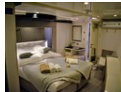
Main and upper deck cabin