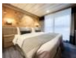
Studio Single Veranda Stateroom