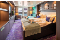
Triple Porthole Twin Porthole