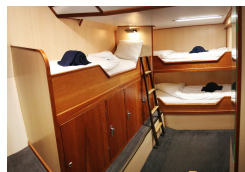
Twin Private Inside