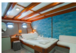
Double Cabin on Love Boat