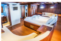
Triple Cabin Freedom