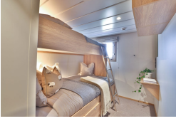
Signature Single - Cabins 6-7 Signature Twin