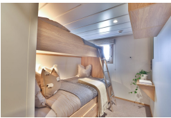
Signature Single - Cabins 6-7 Signature Twin - Cabins 1-2 & 4-5