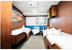
Signature Penthouse (Double)