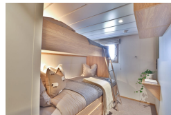
Signature Single - Cabins 6-7