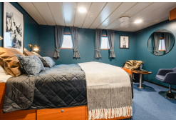
Signature Twin - Cabins 1-2 & 4-5