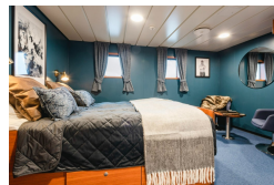
Signature Twin - Cabins 1-2 & 4-5