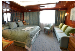
Mawson Deck Premium Suite