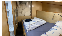
Double Cabin En-suite