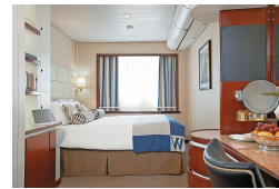
Category AX cabin